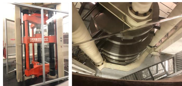
Figure 1: The 1 MN deadweight force standard machine

anchored to the load-bearing structure arranged at 120^\circ on a diameter of about 6 m (Figure 1).