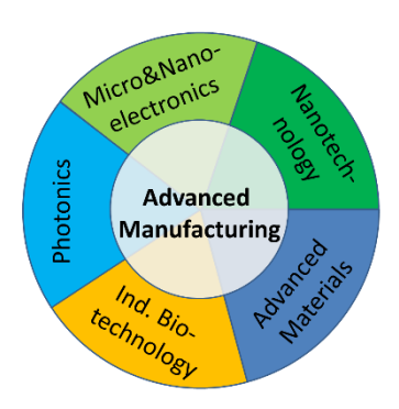
Figure 1. Advanced Manufacturing and its related Key Enabling Technologies (KET)

The EC has identified Key Enabling Technologies (KET) as the basis for innovation [1]: "KETs are a group of six technologies: micro and nanoelectronics, nanotechnology, industrial biotechnology, advanced materials, photonics, and advanced manufacturing technologies. They have applications in multiple industries and help tackle societal challenges. Countries and regions that fully exploit KETs will be at the forefront of creating advanced and sustainable economies".